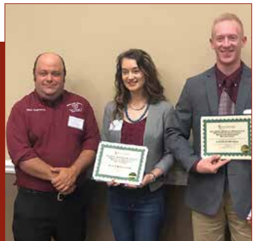
Missouri State University scholarship recipients