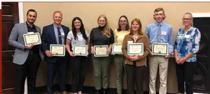
Missouri University scholarship recipients