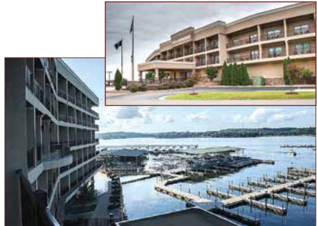
Camden on the Lake Resort, Spa, & Yacht Club 2359 Bittersweet Rd - Lake Ozark, Missouri 65049 573-365-5620 • info@camdenonthelake.com